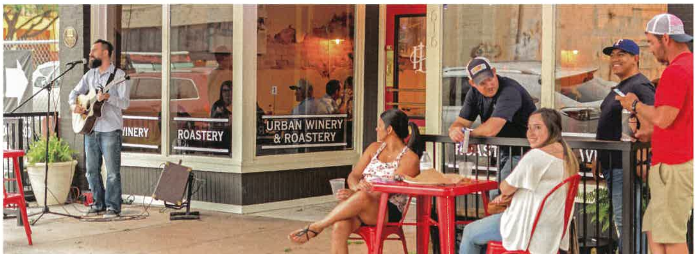
PHOTOS (CLOCKWISE FROM BELOW LEFT) Hook & Ladder Coffee Co., Adobe/Nick Fox, Buddy Holly Hall of Performing Arts and Sciences, Hilton Hotels

When they think of Amarillo, most people think of Route 66 or the 72-ounce steak challenge at the Big Texan Steak Ranch. Once attendees have put down their forks, the city does feature numerous Route 66 landmarks, diners, and attractions. Amarillo's proximity to destinations like Palo Duro Canyon State Park—the second-largest canyon in the United States—and Cadillac Ranch, a public art installation featuring a row of 10 Cadillac cars buried nose-first in the ground, gives it an artistic vibe mixed with Western culture.